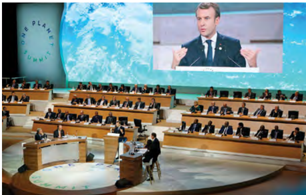
This initiative is championed by President Emmanuel Macron of France